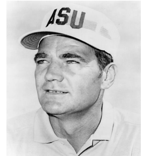
Remembering Frank Kush (1929 – 2017)