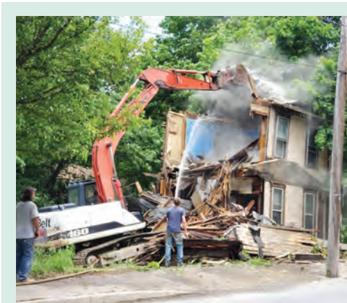
A blighted property along Menoher Boulevard is razed in June as part of an ongoing effort to remove over 100 blighted buildings in Johnstown.

Altogether over the past two years, the Foundation has made a major commitment of more than $1.3 million toward blight eradication in the Johnstown area, and this includes support for leveling, seeding, and, at higher-visibility sites, installing wooden fencing and ornamental grasses. Those beautification steps are set to begin in late 2020.