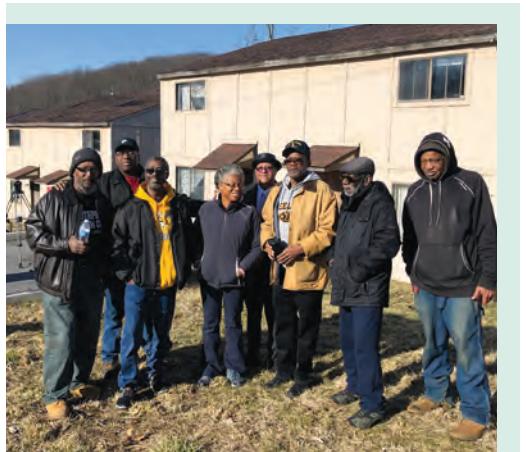
Neighbors in Johnstown's Prospect neighborhood gather for an announcement of more than $650,000 in funding to fight blight on local streets.