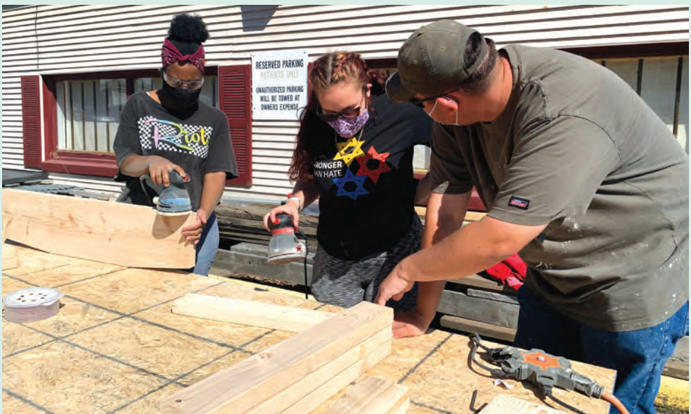
Johnstown Youth Corps members spent the summer making improvements around the city and constructing beds for kids who need them.