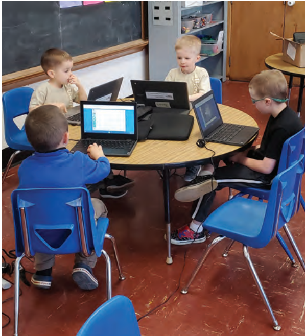
The COVID-19 Rapid Response Fund provided support to the Learning Lamp for Chromebooks for children of emergency services and healthcare workers.

For 30 years, Community Foundation for the Alleghenies (CFA) has worked to prepare for and respond to community needs, including those that we may never have anticipated. We've helped to connect thousands of donors with change-making work happening on the ground. This happens through grantmaking throughout the year and by investing and saving for the funding needs of future generations. It can be hard to measure that impact because it often adds up to so much more than dollars. Over the past three decades, we've made grants and charitable distributions of more than $110 million on behalf of our donors. What kind of impact has resulted?